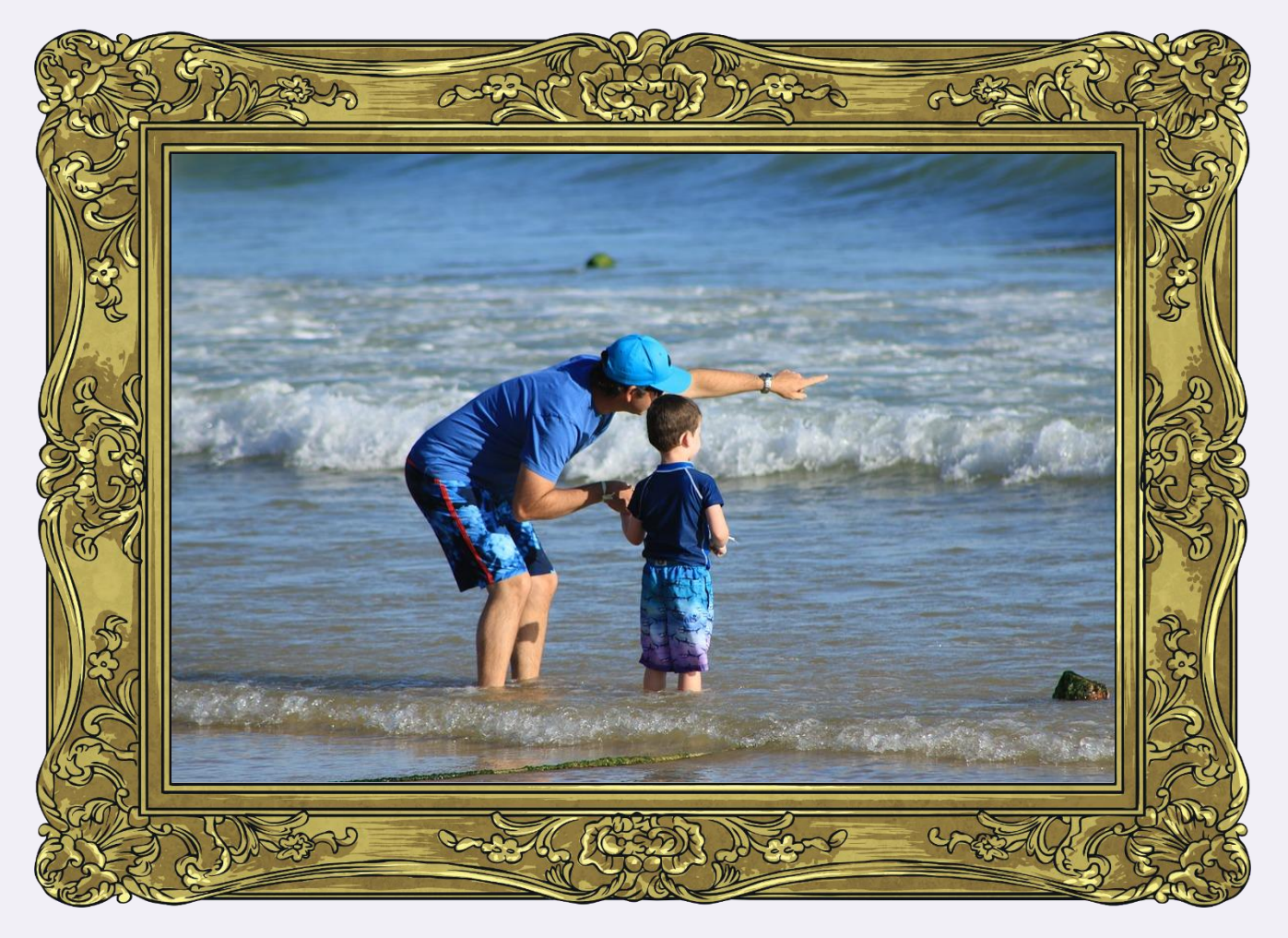
Photo courtesy of taniadimas(@pixabay.com) - granted under creative commons licence - attribution