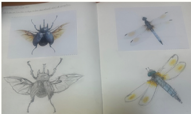
Nicole - Cherry