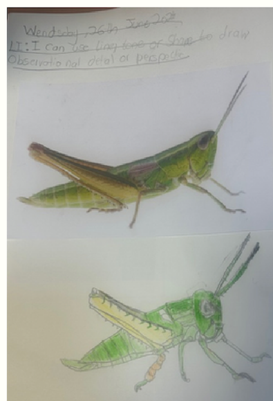
Josiah - Chestnut